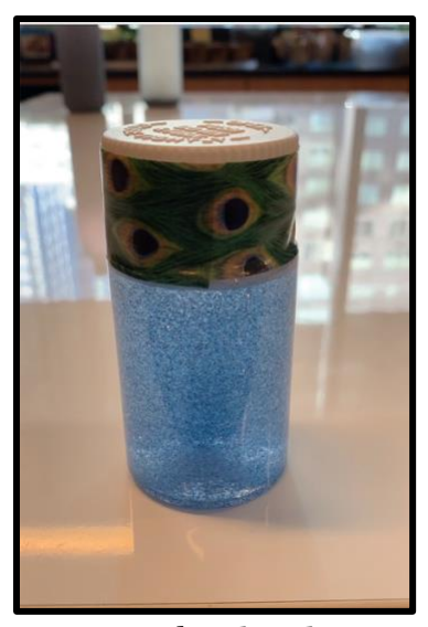
100 cc packer bottle

Materials: bottle with child proof cap warm water Aleen's Clear Tacky Glue glitter glue fine glitter duct tape